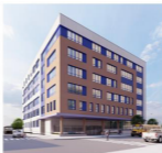
MAIN FACADE VIEW