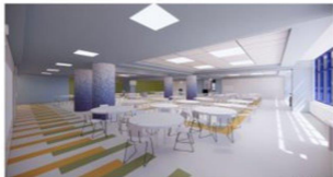
CAFETERIA, AERIAL VIEW