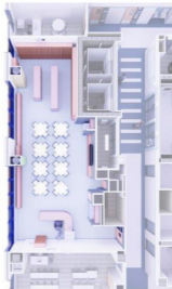
LIBRARY AERIAL VIEW