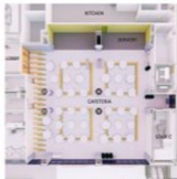
CAFETERIA, AERIAL VIEW